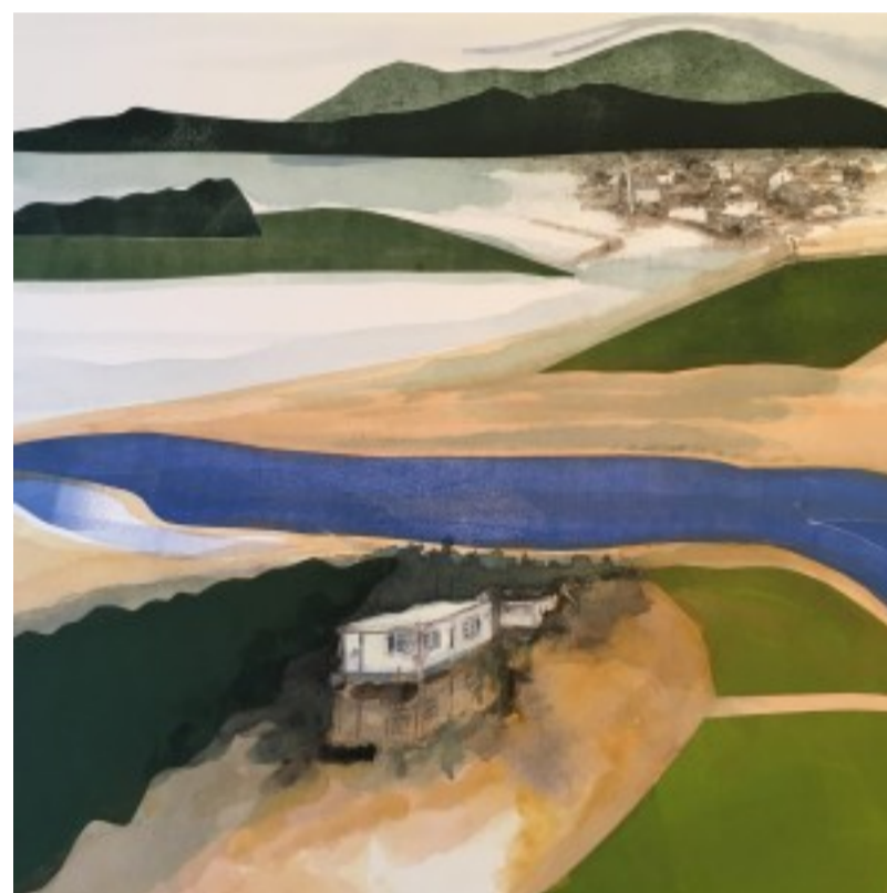
"Water on the Mountain" (detail) incorporates UW scientists' information about how climate change will affect the Skagit Valley.